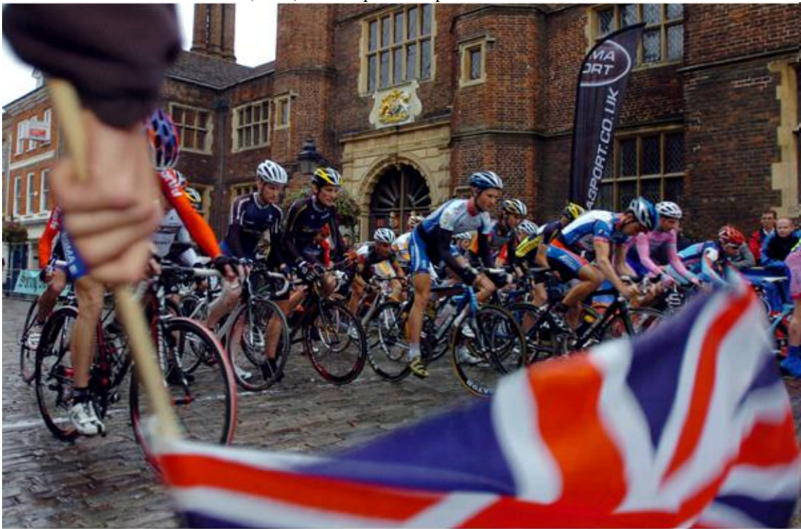
Riders at the start of the Elite Criterium at last years event

20:00 - The Guildford Criterium (E/1/2) 50mins plus 10 laps